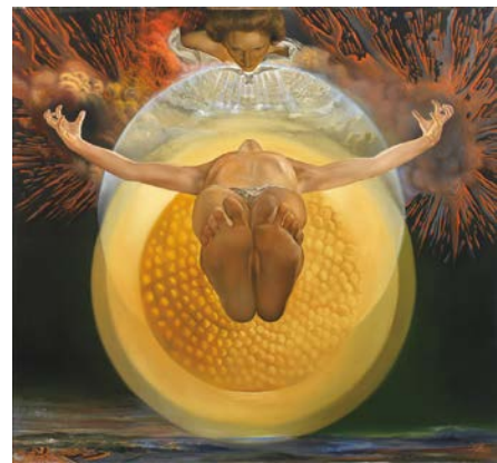
Salvador Dalí, La ascensión de Cristo (Piedad) ( The Ascension of Christ (Pietà) ), 1958, Oil on canvas, 115 by 123 cm (45% by 48% in.). Mexico, Pérez Simón Collection. Photo: Studio Sébert Photographes. © 2018 Salvador Dalí, Gala-Salvador Dalí Foundation / Artists Rights Society (ARS), New York

in the exhibition reveals the artist's skill as a colorist throughout a range