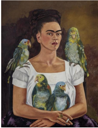
Frida Kahlo, Me and My Parrots , 1941

including her famous painting La Venadita (The Little Deer) (1946) and her commanding self-portrait Me and My Parrots (1941). Carrington, Tichenor, and Varo typically worked in illustrative styles, fusing autobiography, cosmic and ancient myths, and poetic aspects of the natural landscape in developing their own unique forms of magic realism. While the thematic sources of Carrington's work, which included alchemy, Gnosticism, shamanism, and other esoteric subjects predated her arrival in Mexico, it was there where Carrington, away from a stifling upbringing and the horrors of war, discovered the freedom to cultivate a deeply personal and codified visual language. Works such as the exquisitely rendered Les Distractions de Dagobert (1945) reveal Carrington's remarkable ability to evoke mysterious and intimate rituals. Varo similarly found creative liberation in Mexico. Her paintings often contain figures on expedition or conducting ritualistic acts among the cosmos, as in Papilla estelar (Celestial Pablum) (1958).