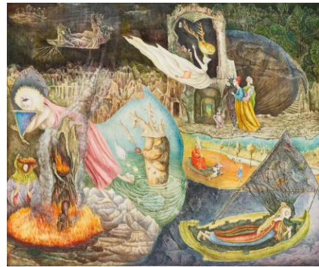
Leonora Carrington, Les Distractions de Dagobert , 1945

including her famous painting La Venadita (The Little Deer) (1946) and her commanding self-portrait Me and My Parrots (1941). Carrington, Tichenor, and Varo typically worked in illustrative styles, fusing autobiography, cosmic and ancient myths, and poetic aspects of the natural landscape in developing their own unique forms of magic realism. While the thematic sources of Carrington's work, which included alchemy, Gnosticism, shamanism, and other esoteric subjects predated her arrival in Mexico, it was there where Carrington, away from a stifling upbringing and the horrors of war, discovered the freedom to cultivate a deeply personal and codified visual language. Works such as the exquisitely rendered Les Distractions de Dagobert (1945) reveal Carrington's remarkable ability to evoke mysterious and intimate rituals. Varo similarly found creative liberation in Mexico. Her paintings often contain figures on expedition or conducting ritualistic acts among the cosmos, as in Papilla estelar (Celestial Pablum) (1958).