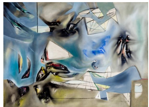
Matta, Centro del agua (Center of Water) , 1941

For artists in this exhibition who had been part of the Surrealist circle in Europe, the practice of living and making art in Mexico quickly demythified notions of the country that had been constructed across the Atlantic. The fertile art-historical moment addressed by Surrealism in Mexico comprises pictorial innovations involving both figuration and abstraction, united by investigations into the physical and unseen worlds, as artists adapted conventional Surrealist strategies to the new experience of being in Mexico. This remarkable period of expansion, in both aesthetic and conceptual terms, resulted in work that would come to define major episodes in these artists' careers, and transform notions of Surrealism beyond Europe's borders.