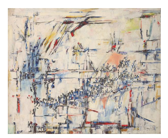
Sans Titre. 1955. Oil on canvas, 60 by 73 cm (23% by 28% in.)

signature matrix. The geometry of squares and floating lines is challenged by the freedom and abstraction of her peach, maroon, and navy brushstrokes. The floating lines in Sans Titre resemble a network of paths—a recurring motif in the artist's oeuvre. In this instance, the paths in Sans Titre disorient and prohibit the viewer from fixating on any individual point in her labyrinth. Sans Titre is among several compositions Vieira da Silva painted during the 1950s that recall urban landscapes and the harrowing reality of post-war Europe.