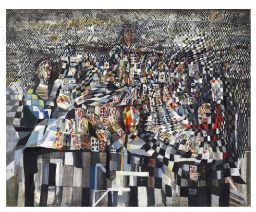
Les Joueurs de cartes. 1947-48. Oil on canvas, 81 by 100 cm (31% by 39% in.)

at the outbreak of World War II. Vibrantly colored hearts, spades, kings, and queens reach out toward the viewer in a shuffling motion, traversing the canvas and its inherent two-dimensionality. The recurrence of games in Vieira da Silva's work functions as a metaphor for the playful exchange between viewer and canvas, spectator and artist.