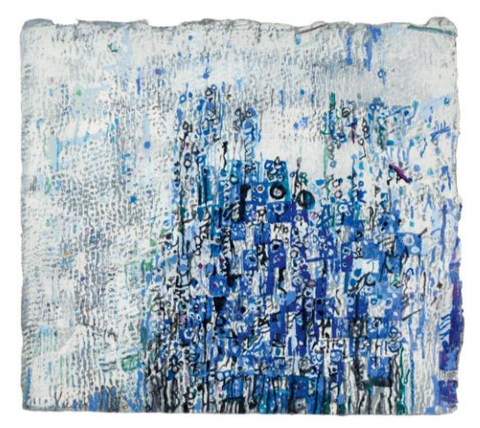
Le Jardin d'ipomée. C. 1974. Tempera on handmade paper, 30 by 33 cm (11¾ by 13 in.)

scholarship has emphasized the role of American artists in the development of post-World War II abstraction with the emergence of movements such as Abstract Expressionism and Color Field painting. Artists active in Europe following the war, however, played an equally central role in the progression of abstraction, practicing gestural forms of expression across movements including art informel and tachisme . Working in a pivotal moment within the modernist canon, Vieira da Silva forged a unique path forward for the legacy of abstraction in Europe and globally—one in which abstract forms and structures unite with lived experience in the creation of a new form of subjective vision.