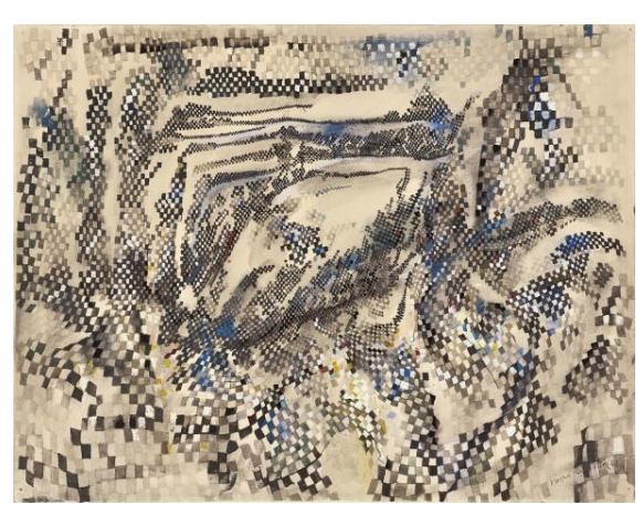
Composition aux damiers bleus. 1949. Gouache on paper, 49.6 by 65 cm (19½ by 25½ in.)

In Sans Titre, 1955, Vieira da Silva focused on the gesture of the brushstroke while maintaining her