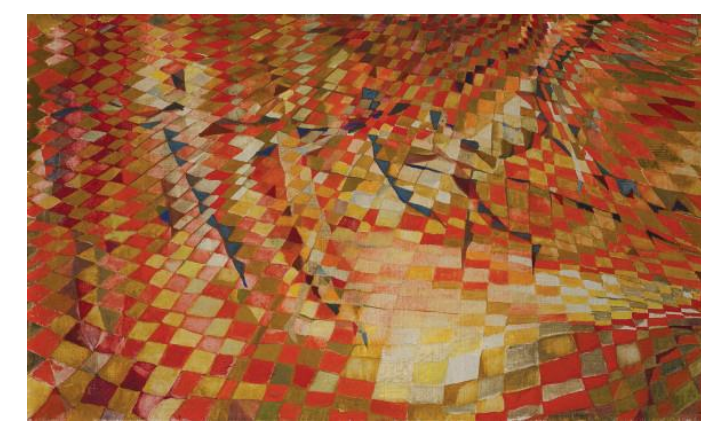
Figure de ballet. 1948. Oil and pencil on canvas, 26.7 by 46 cm (10% by 18% in.)

Les Joueurs de cartes, 1947-48, continues the artist's investigation of the grid through a systematic structure of small square and rhomboidal shapes. Upon her return to Paris in 1947 after her wartime exile to Rio de Janeiro, Vieira da Silva further explored the theme of card games in her paintings but focused explicitly on the interaction between players. Aligned in a diamond shape and composed of playing cards, the four figures in the center of Les Joueurs de cartes become one with the game itself. This work exemplifies Vieira da Silva's commitment to her post-Cubist structures and proves her ability to make the Cubist grid malleable and capable of inspiring movement.